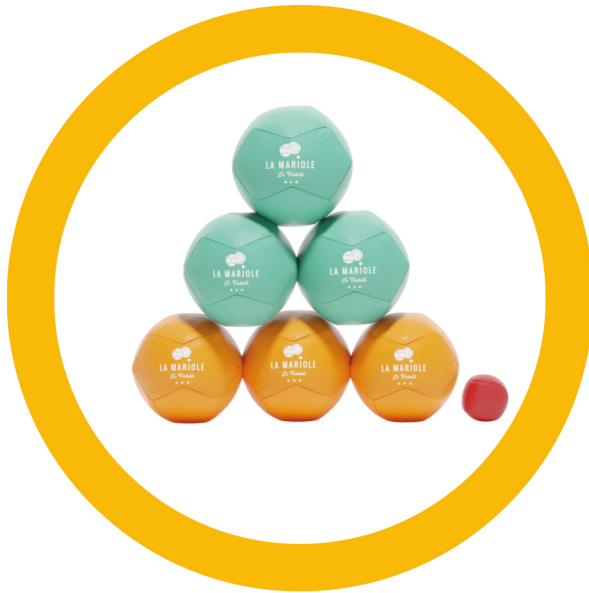
RAOUL PACK Orange & Turquoise

Ecological pack made from recycled leather Manufactured in the Mediterranean basin