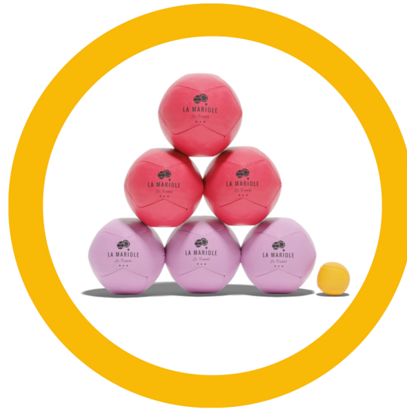
FÉLICIE PACK Lilas & Ruby