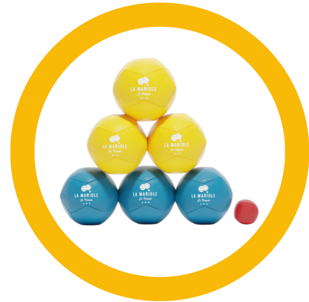
MARCEL PACK Blue & Yellow